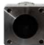
ImSpector V8E/V10E spectrograph, front view