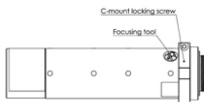
ImSpector V8/V10 mechanical dimensions