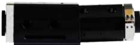
ImSpector V8E/V10E spectrograph, side view