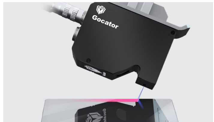
Gocator® 2512 scanning cell phone cover glass assembly

Unique scanning capability, optimized optical design, and wide FOV on specular targets—combined with a smart all-in-one design—make Gocator® 2512 faster, easier to use, and more cost-effective than competing glass scanning technologies such as confocal scanners.