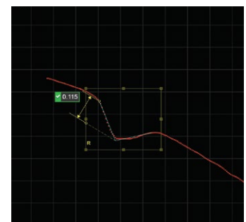
Apply built-in measurement tools