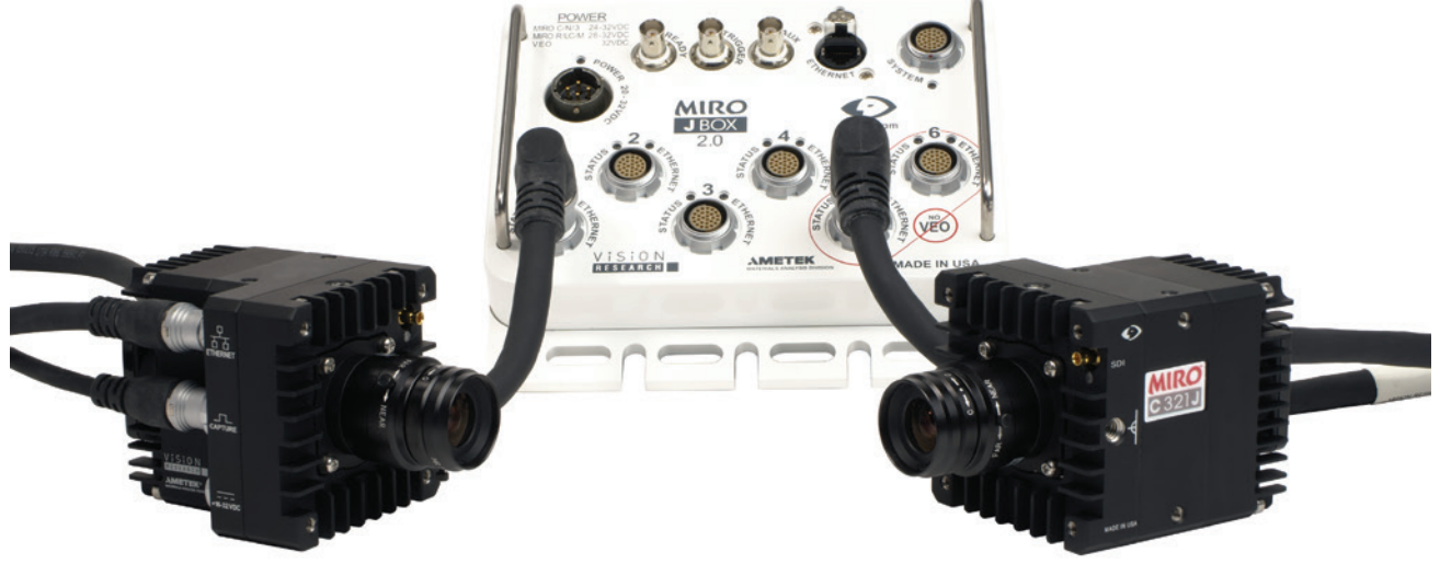
Miro C321/C321J Connectors With the Miro Junction Box 2.0